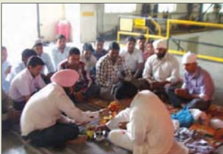
Satyanarayana Pooja on Anniversary day

class hydel plant. Our team of engineers, known for their courteousness to visitors, were extremely warm in ushering the students around the plant site, answering their enthusiastic queries. The students were delighted with the first hand knowledge that they were able to gather from the experts.