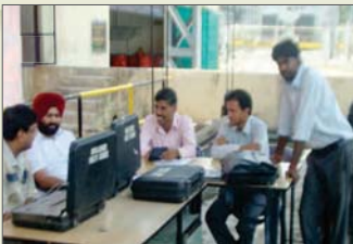
Performance test by IIT Roorkee

Dadupur had interesting visitors as a group of Degree students from 'Doon Valley Institute Of Engineering & Technology', Karnal, visited the plant site to learn about operations in a world