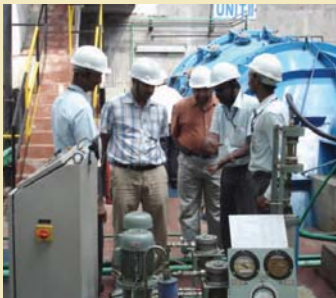
▲ ISO Surveillance Audit at Mandagere

QUALITY QUOTIENT: ISO 9001:2008 | ISO 14001:2004 | OHSAS 18001:2007