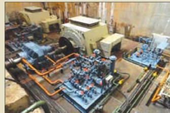
The color coded TG unit