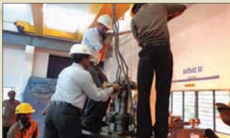
New thrust bearing replacement for U#1 Gearbox

On 14th April a minute's silence was maintained in homage to the victims of the fire accident at the Mumbai dockyard on 14th April 1944. Professionals in remote corners of the globe still join the families of the victims in praying for the souls of those who perished.