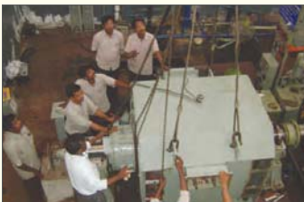
Gear box generator alignment work is in progress