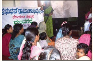
▲ Health Awareness programme at Chikka Mandagere