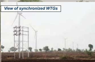
View of synchronized WTGs

The 110 Kv transmission line was energized and the pooling station was commissioned on 26th April. Electrical work at all substations have been completed with the erection of equipment and transformer. The laying of all control and power cables has been completed.