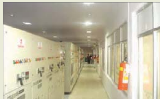
Control room after false ceiling

Establishing and maintaining a world class powerhouse has been a tradition at BPCL, where no stone has been left unturned in identifying and fulfilling areas for improvement in appearance and neatness of powerhouse buildings. At Sattegala, the powerhouse has been beautifully painted on the both the inside and outside. A false ceiling has been fabricated in the control room to spruce the interiors.