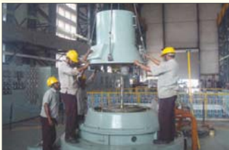
Maintenance work on generator under progress

The Fire Services Week which set off demos on 20th April, was observed with overwhelming participation from employees. Demos on the