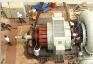
Unit #1 generator rotor being installed