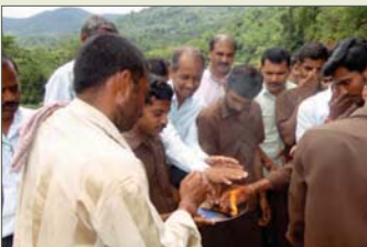
Invoking God's blessings during Ganga Pooja

Erection of unit #1 generator rotor was quickly completed after replacement of faulty coils.