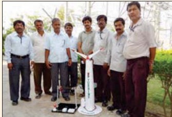
Renewable Energy model for science project ▲