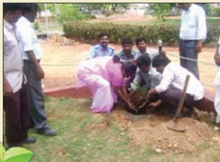
At Rajankollur , all employees were present to plant the saplings