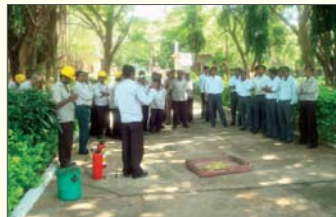
Awareness session on Fire Services Day

use of various types of fire extinguishers during emergencies were explained. Awareness programmes on the causes of different types of fires were held. All employees participated in the sessions. Brochures on road safety and personal hygiene were distributed.