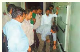
Breaker retrofitting under progress