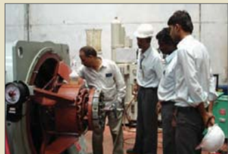
DGM (O) inspects the machinery