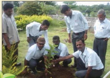
At Mandagere , all teams participated in planting fruit tree saplings in the powerhouse premises. Awareness programmes were conducted.