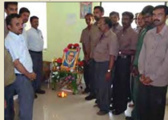
Dr. Ambedkar Jayanthi participation

Various safety enhancements were thought out and implemented at the plant site to better the work environment and ensure greater safety for the employees.