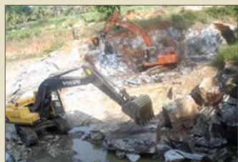
Civil work in the power canal was exhaustive

A team of TCE and BPCL engineers from Bangalore visited the Mandagere site on 4th May to inspect the power canal from zero chainage to 1100m. The visiting team came up with a list of valuable suggestions and possible enhancements on the civil front. The task list was taken up after a Bhoomi Pooja performed by a local temple priest. The major civil work for this year centers around civil modification in the canal and is being taken up meticulously. The work is expected to be completed in a short while.