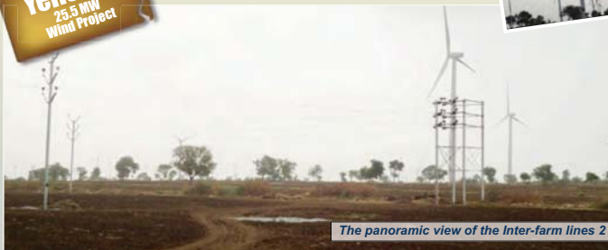
The panoramic view of the Inter-farm lines 2

The Yelisirur wind project has taken shape, holding the promise of emerging as one of our most successful projects.