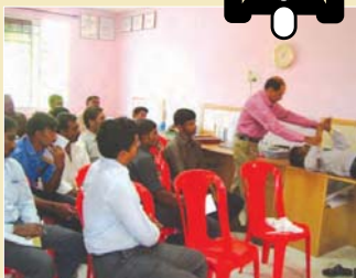
▲ The First Aid training session had the participation of employees in SRD Katte