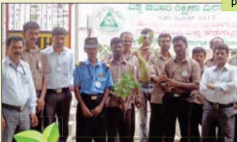
At Madhavamantri , all employees came together to observe the event and plant saplings