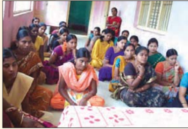
▲ SHG Meeting at Hemmige

Skill Development: 75 Girls have completed Skill Development Training courses in Tailoring, Fashion Designing and Computer Applications (BASIC, DTP and TALLY).