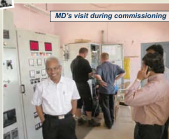
MD's visit during commissioning