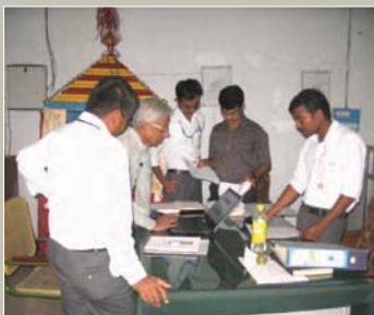
CDM Audit at Sugur