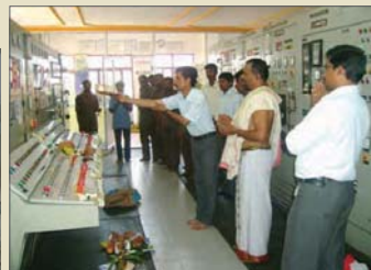
Pooja before machines were started

At SRD Katte, the annual maintenance work was systematically completed without delays or hitches. As the BPCL tradition would have it, a Ganga Pooja was performed and the beautifully spruced up machines were restarted. The plant is slowly progressing on power generation ensuring minimized downtime of machine breakdown.