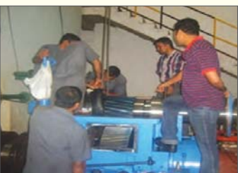
Engineers engrossed in maintenance work

The maintenance work at Neria has been completed and the machines are all set for generation. Work at Neria began on a positive note and went on smoothly without any hitches. The enthusiastic team of engineers were focused on completing the tasks on schedule.