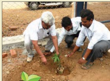
The Yelisiur team kept up with the BPCL spirit and joined in with their share in the green initiative

The Neria team planted saplings. Sugur team greeted the day together with programmes on environmental awareness. At Sattegala , the celebrations spun around the theme "Preserving the environment for future generations". All participants spoke on this occasion and expressed