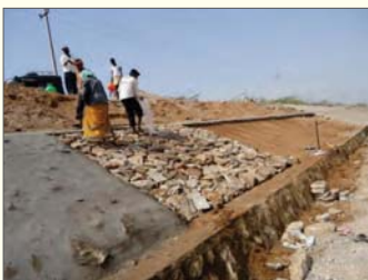
The canal repair work is making progress

At Shahapur, the team of enthusiastic engineers were quick to take up the annual maintenance chores one after the other and