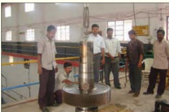
Gear box maintenance work in Unit #1

The team at Rajankollur set out to complete the canal closure work as per schedule. Maintenance work is underway and will be completed soon. Major work has been taken up on unit #2 gear box. Turbine couplings and gear box bearings have been replaced as there was a misalignment between the gear box and the generator. Unit #1 gearbox maintenance was also taken up this year.