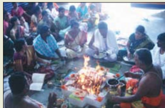
Ganapati Homa on Anniversary Day