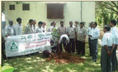
At Shivapur , the Plant Manager spoke on the importance of environment awareness. To mark the event saplings were planted in the site premises.

that reflect their concerns for the environment. To draw everyone onto a single thought platform on environment, we celebrate the World Environment Day with involvement, fanfare, fun, activity and competition where everyone participates, appreciates the effort and has their voice heard on the value of environment.