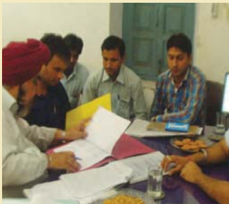
▲ The First External Surveillance Audit at Dadupur

■ 2nd Surveillance Audit was completed for Chayadevi, Shahapur, Sattigala, Madhavamantri, Mandagere and Corporate Office, by a team from M/s. ICS Bangalore. The first surveillance audit has been completed for Dadupur station by M/s ICS