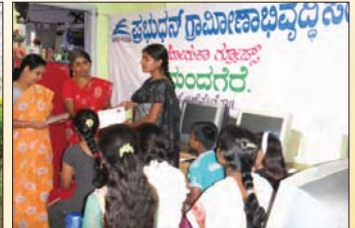
Computer training as part of the skills development programme had the participation of many young people ▲