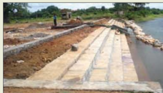
Sopanam is being constructed