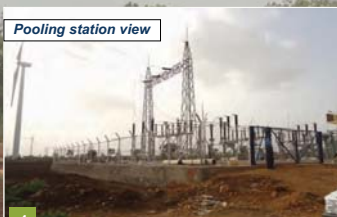
Pooling station view

All civil work involved in the construction of the turbine foundations and pooling stations has been completed. Substations for all locations have been completed. Surface finishing work for WTGs is in progress.