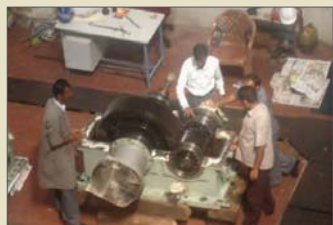
Gear box maintenance work by team