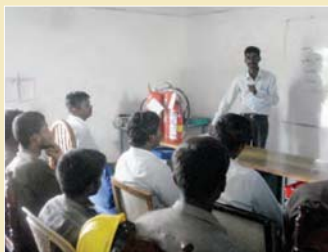
▲ Training on different types of extinguishers at Sattigala