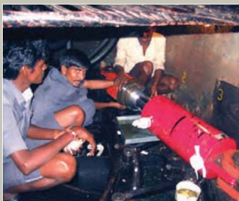
Annual maintenance work under progress

To ensure safe commuting for the public and personnel, a chain link fence has been put up for 500 meters along the right side of the tail race canal where the approach road coincides. With this facility all commuters move along this path comfortably without any fear.