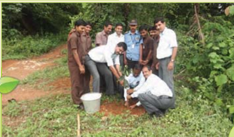
At Manjanadaka there was much excitement among the engineers as they got together to plant jackfruit saplings on the plant premises