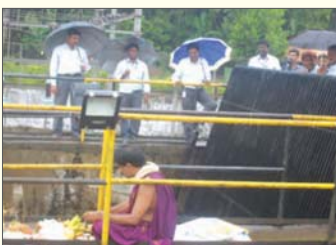
Rains did nothing to dampen religious sentiments during the Ganga Pooja

The Neria Plant Site is situated in utterly serene environs. The spiritual aura of a temple town adds to Neria's natural charm. Our employees at the site draw personal pride in maintaining the gardens and developing the greenery with flowering plants, fruit saplings and lawn grass.