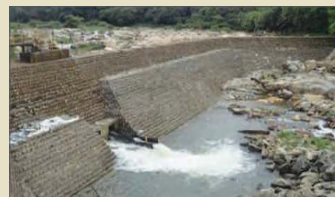
A view of the strengthened overflow weir