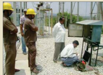
TVM meters are being calibrated