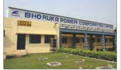
Saplings were planted on the premises

Saplings have been planted and ground has been leveled for developing the powerhouse premises.