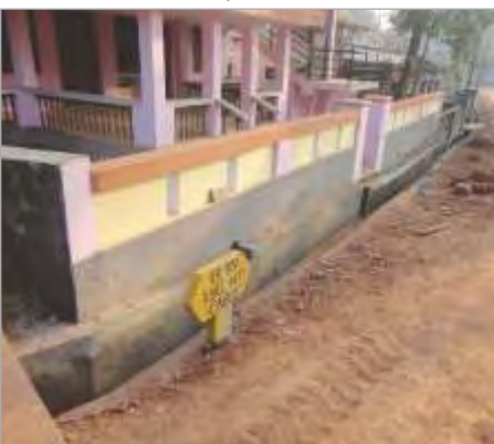
Signage indicating cable route is up

routes were provided at Sullia city. Fabrication of a stand for OCY breakers is under progress. The 33 KV DC line from power house to Sullia is under