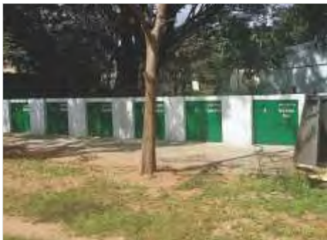
Waste management system

Superb waste management: Storage structures are being fabricated and labelled for storage of all kinds of wastes to ensure hassle-free storage and efficient handling of industrial wastes.