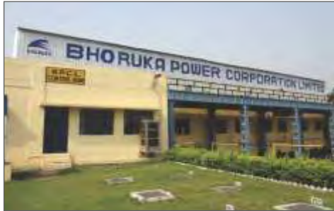
Saplings were planted on the premises

Saplings have been planted and ground has been leveled for developing the powerhouse premises.