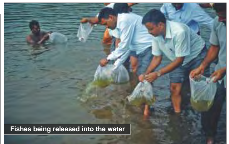
Fishes being released into the water

Safety measure: Installation of CC camera to monitor the entry and exit points on the powerhouse premises has been completed.