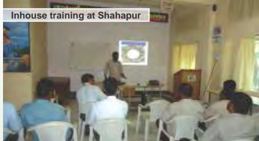
Inhouse training at Shahapur