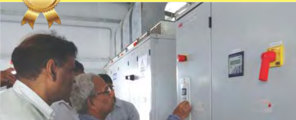
MD presses the inverter start button to synchronize BPCL's first Solar plant.

A wide view of solar plant. The modules are cleaned by sprinkling water jet on them in the late hours of the evening to clean the dust deposits if observed on the solar panels. The cleaning water system has six huge water tanks of 10,000 liters each with six pumps and pipelines.