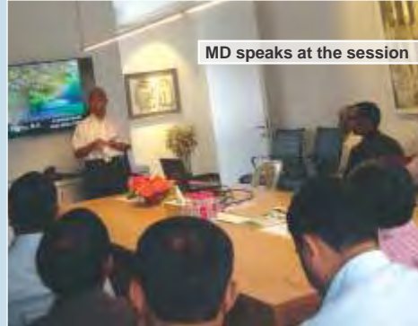
MD speaks at the session