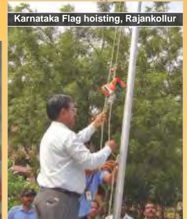
Karnataka Flag hoisting, Rajankollur