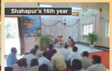
Shahapur's 16th year