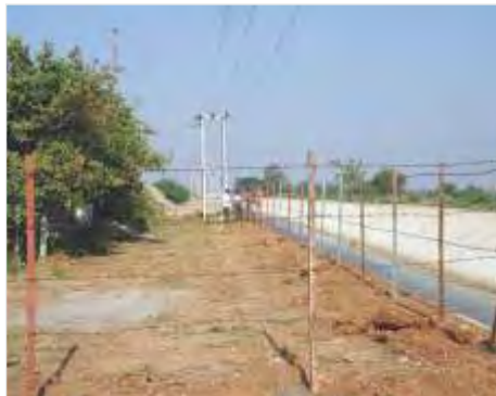
New fencing near scheme #3

Safety: A chain link mesh has been provided near Scheme #3 along the approach road of the side canal for safety of the commuters.