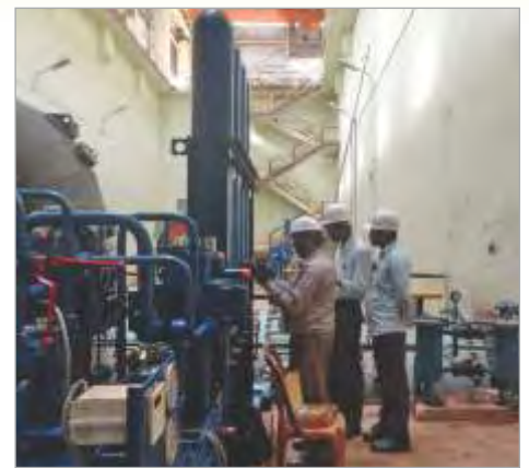
Calibration works under progress

progress. Checking of Lifting tools and calibration of pressure vessels have been completed by an authorized agency.