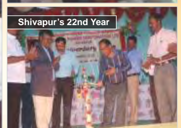
Shivapur's 22nd Year