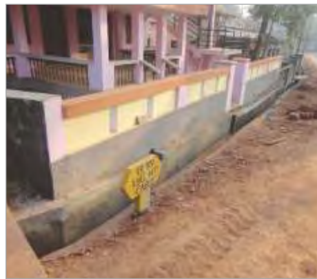
Signage indicating cable route is up

Electro-mechanical: Boards for indicating cable routes were provided at Sullia city. Fabrication of a stand for OCY breakers is under progress. The 33 KV DC line from power house to Sullia is under