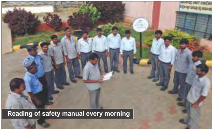
Reading of safety manual every morning