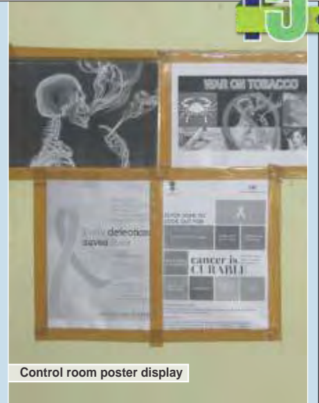
Control room poster display