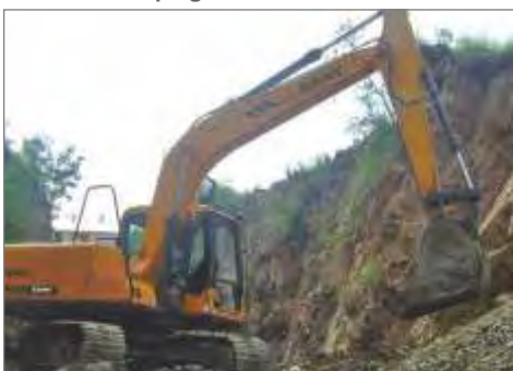
Work on the tail race canal

Repair: The Service road on the right side flow of the tail race canal collapsed due to continuous rain, with soil settling at the TRC junction point. A excavator was deployed to clear the place with minimum loss in generation.