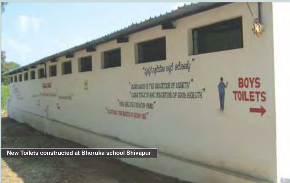
New Toilets constructed at Bhoruka school Shivapur

New toilets, fully tiled have been built separately for boys and girls. The toilets are built to modern standards and have all facilities for maintenance. Students and parents were happy with this new addition. They thanked the management for the quality education that they promote.