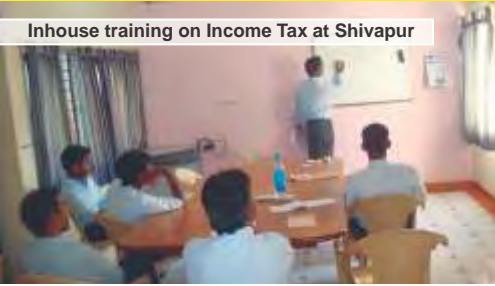
Inhouse training on Income Tax at Shivapur