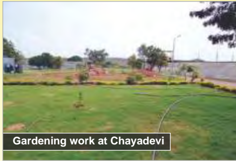
Gardening work at Chayadevi

Courage is what it takes to stand up and speak; courage is also what it takes to sit down and listen.