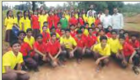
Students from Morarji Desai Institute

Dandela: Final year students from SDM Polytechnic were happy to interacted with the engineers during their visit. Students from Morarji Desai Institute were also taken around the plant site by our teams.