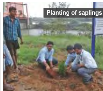
Planting of saplings