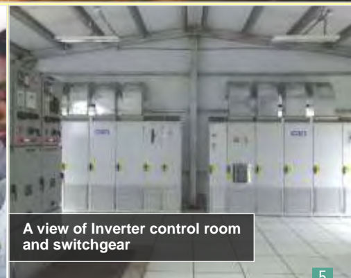
A view of Inverter control room and switchgear