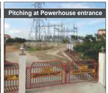
Pitching at Powerhouse entrance

Powerhouse: Pitching and concrete work at the entrance, near the main gate, has been completed. 200 saplings have been planted in the powerhouse premises by our team members.