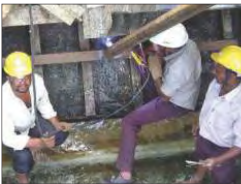
Work on escape gate

Repair: The Service road on the right side flow of the tail race canal collapsed due to continuous rain, with soil settling at the TRC junction point. A excavator was deployed to clear the place with minimum loss in generation.