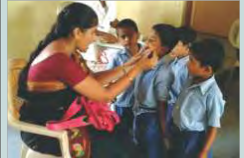
Children being screened at the Checkup Camp

Bhoruka Welfare conducted an Eye Checkup Camp on 20th November, and General Health Checkup Camp on 15th November at Shahapur School.