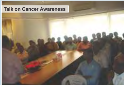
Talk on Cancer Awareness

and across corporates on Cancer in terms of what should they look out for, the risk factors that can be minimized through individual efforts as well as some critical preventive practices, CII sent posters to our plant sites which were displayed at critical points. Further, a one hour talk by a reputed Doctor was organized for employees on 15th November.