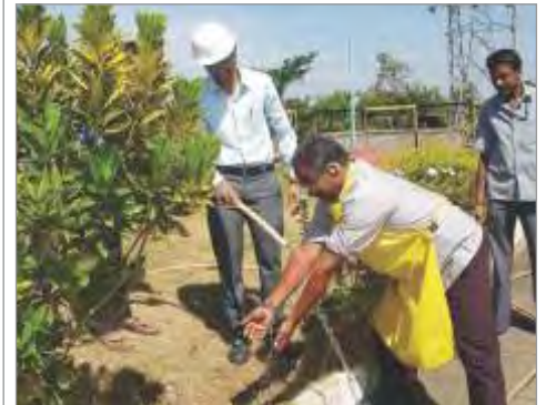
Mock drill on Electrolytes under progress

Mock drill was conducted to demonstrate the response a victim should ideally exercise when electrolytes fall on his or anyone else's body.