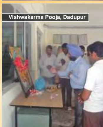
Vishwakarma Pooja, Dadupur