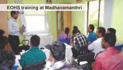
EOHS training at Madhavamanthri