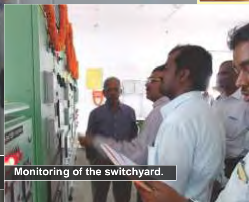
Monitoring of the switchyard.